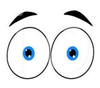
BHitToonCom * illustrationsOf.com/434727

The National Bureau of Economic Research recently published a paper titled "A Tale of Repetition: Lessons from Florida